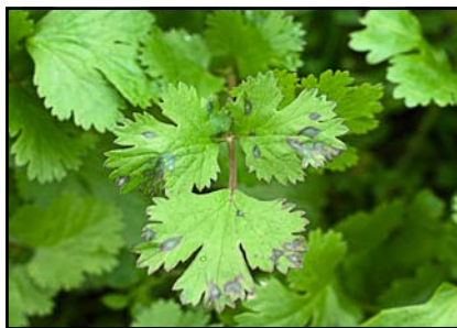
4. 'Blue spot' symptoms are only visible on the upper leaf surface.

For more information on disease symptoms caused by other pathogens, see the HDC Herbs Best Practice Guide at http://www.hdc.org.uk/herbs/ .