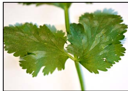
5. 'Oedema' symptoms are only visible on the upper leaf surface.

Precise conditions for infection and disease development have not been established, but coriander bacterial blight is considered a disease of cool, wet weather.