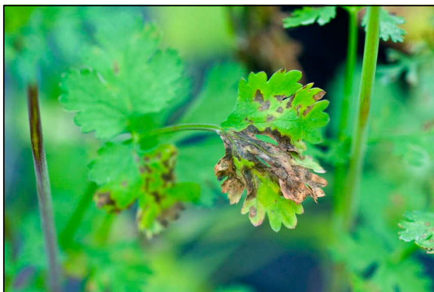
1. Typical brown necrotic leaf lesions caused by Pseudomonas syringae pv. coriandricola . Stem lesions are also visible to the left and right.

The disease can be confused with physiological disorders such as 'oedema', 'blue spot' or 'tip-burn', so it is important to obtain an accurate diagnosis. A characteristic feature of both 'blue spot' and 'oedema' is that