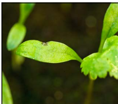
2. Dark water-soaked lesion on a cotyledon caused by Pseudomonas syringae pv. coriandricola