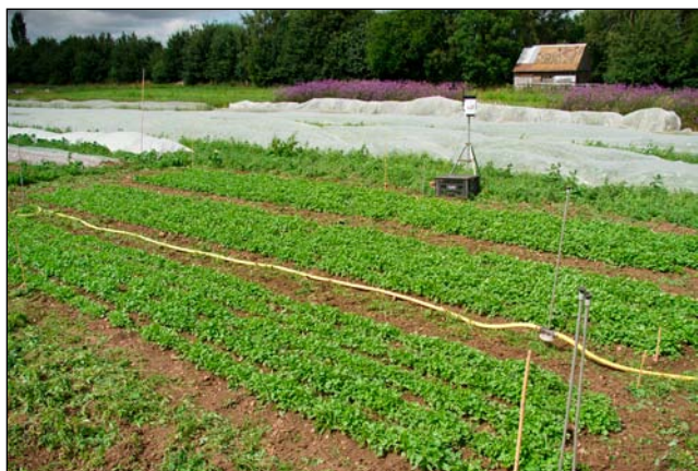
7. Examining the rate of disease spread from a point source in the centre of the plot.

8. (Right) Map of disease spread in field trial. The arrow indicates primary infection. Numbers represent disease severity (0-4 scale).