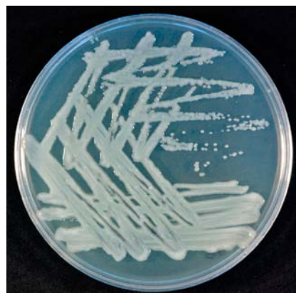
6. Pseudomonas syringae pv. coriandricola growing on an agar plate.

Precise conditions for infection and disease development have not been established, but coriander bacterial blight is considered a disease of cool, wet weather.